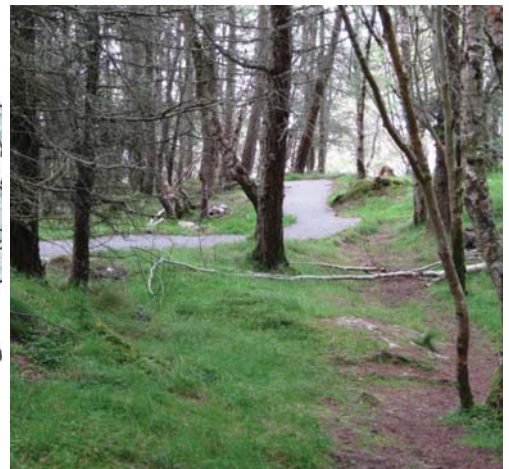
The new and old sections along the White Shore Path

tions from the Highland Council Access Officer. One of the sections already completed is the White Shore Path which is now smoother and more accessible to those who are less able to negotiate the previously rough nature of the ground. A regular walker in the woods has commented that the improved path enables you to look around at the trees providing a new view of the woodland where previously you had to watch out for obstacles under your feet. However wilder paths, such as the 'Are you brave enough' Path will still be available to fulfil the desire for scrambling over rocks and tree roots.