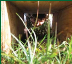
Checking the mink tunnel on the Loch an t-Sabhail Path.