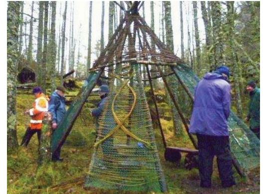
Continuing the willow weaving at the tepee