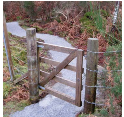
The entrance to the School Path

The School Path is now complete. This is a great asset to the local community, visitors and schools as it gives direct pedestrian access to the woodland. The full length of this path is now a made path where previously it had just been way marked. Recently the Pre School pupils walked its full length to gain access to the White Shore, a feat that would have taken much longer a couple of months ago. A much needed face lift has also been given to the well worn Woodside Path. This path takes the walker from Woodside Car Park into the heart of the woods, past the giant nest, the dragonfly bog and to the junction at the Play area.