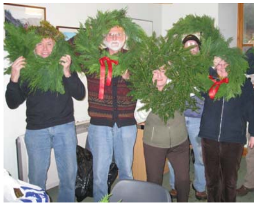
Festive fun with the Woody Group