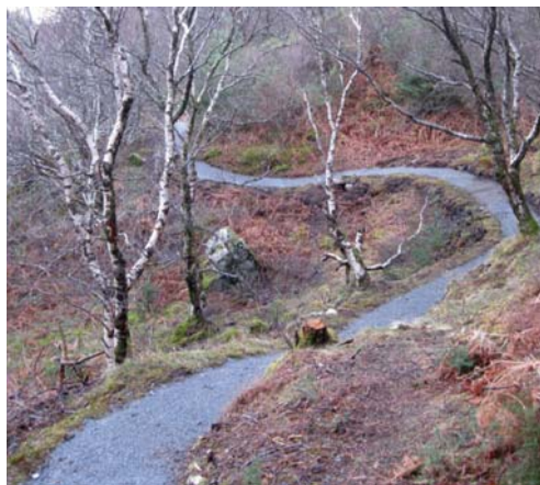
The upgraded path winds down the hill to join the Woodside Path

The Funders for the Culag Woods Access Project are: